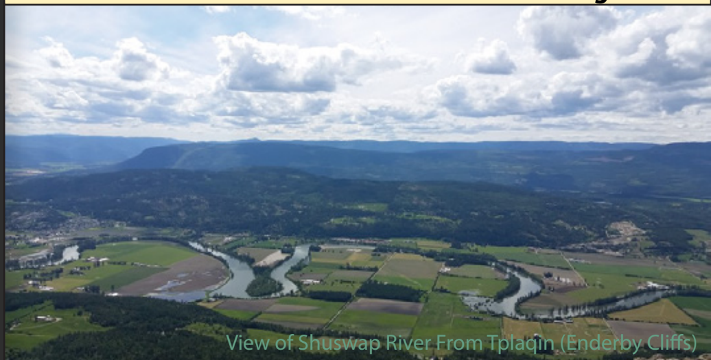
View of Shuswap River From Tplaqín (Enderby Cliffs)