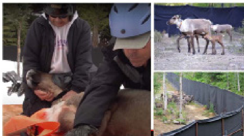
Figure 3. Images taken from the Revelstoke Caribou Rearing in the Wild maternity pen which operated north of Revelstoke between 2014 and 2018.