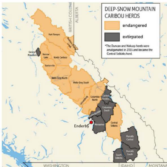
Figure 1. Southern Mountain caribou subpopulations showing the location of existing endangered caribou herds as well as the locations of those that are now locally extinct or 'extirpated'.

In recent years, declines in caribou populations in southern British Columbia have led to the local extinction of several herds including, the Columbia South herd near Revelstoke, the Monashee South herd (which formerly occupied habitats in the Greenbush Lake, Joss Mountain, and Hunter's Range areas), as well as herds in the southern Kootenays (e.g., the South Purcell and South Selkirk) (see map below).