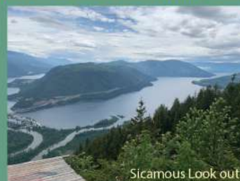
Sicamous Look out